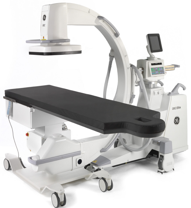
GE OEC is an official distributor of STILLE products

See our full product line at www.stille.se