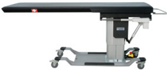
RECTANGULAR TOP OPTION