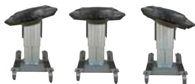
Motion 4 LATERAL TILT \pm 15^\circ