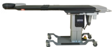
Motion 3 LONGITUDINAL TRAVEL 10"