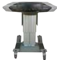
Motion 4 LATERAL TRAVEL \pm 4"