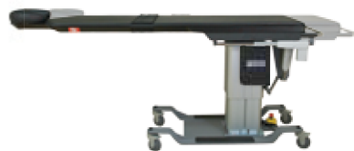
Motion 3 LONGITUDINAL TRAVEL 10"