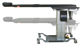
Motion 1 HEIGHT RANGE 26" - 44"